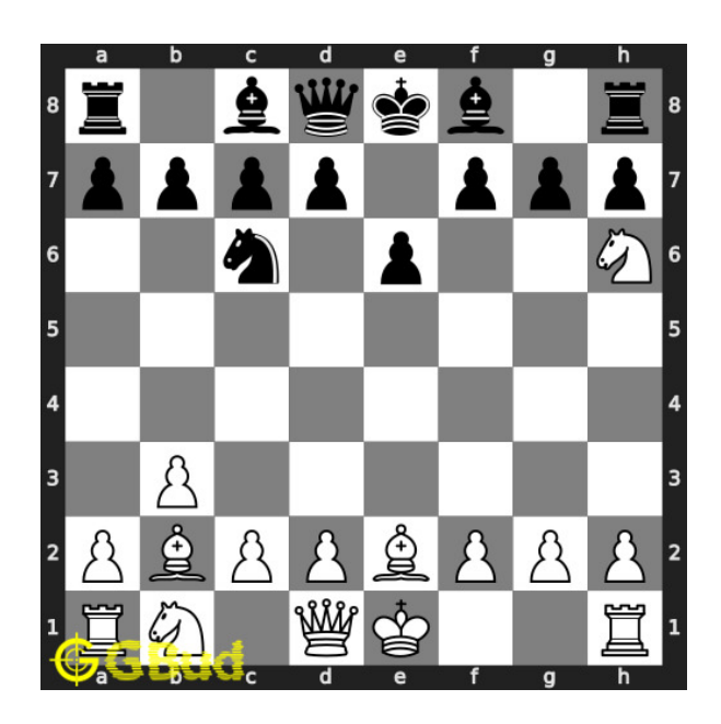
Figure 4: Nxh6 - This sacrifice of the knight is a decoy move to attract the pawn from g7 which blocks the attack of your bishop on opponent's rook