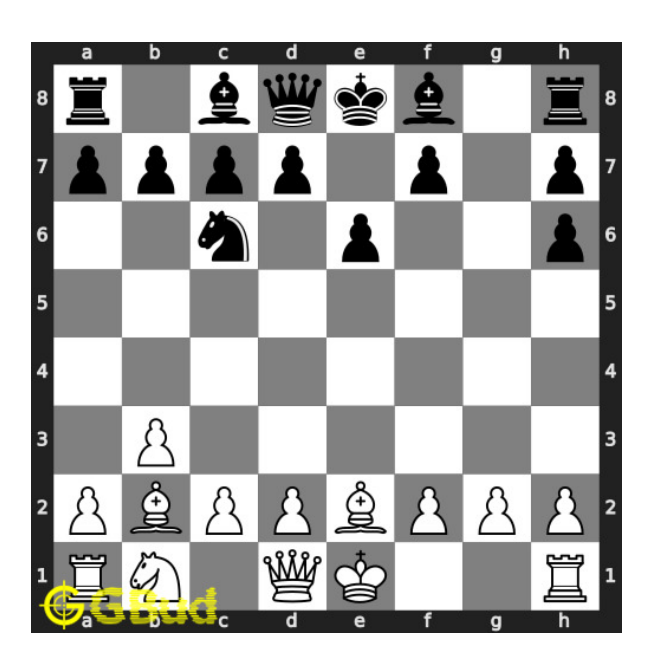
Figure 5: gxh6 - Opponent fell for the decoy move. The pawn captures the knight but opens the diagonal for your bishop