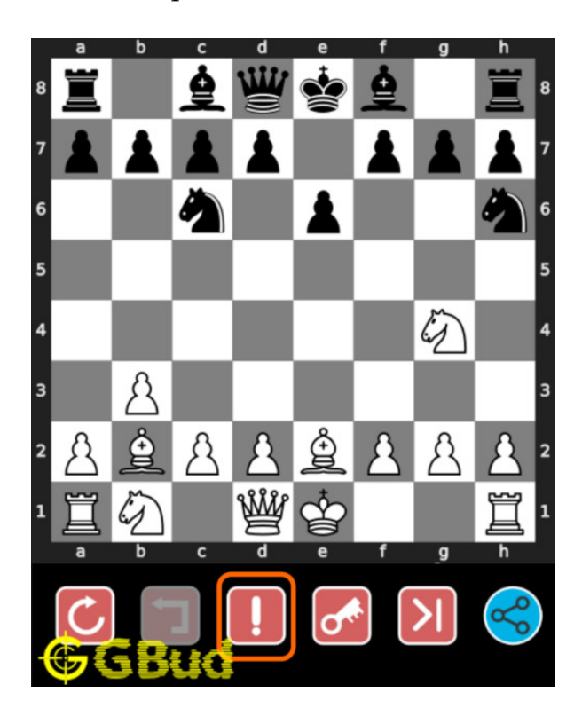
Figure 8: Click the help button to get help on next move @ https://gbud.in/gpyvft2

2. Click the help button (exclamation mark as shown below) to get help or suggestion on next possible move