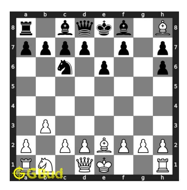
Figure 6: Bxh8 - Since the opponent moved their pawn, your bishop captures the opponent's rook. This is how you can gain the rook